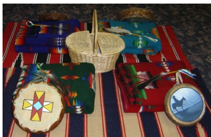
Blankets, drums and eagle feathers given to newly certified trainers.